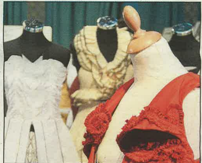
GRAND DESIGNS: Items of clothing on display