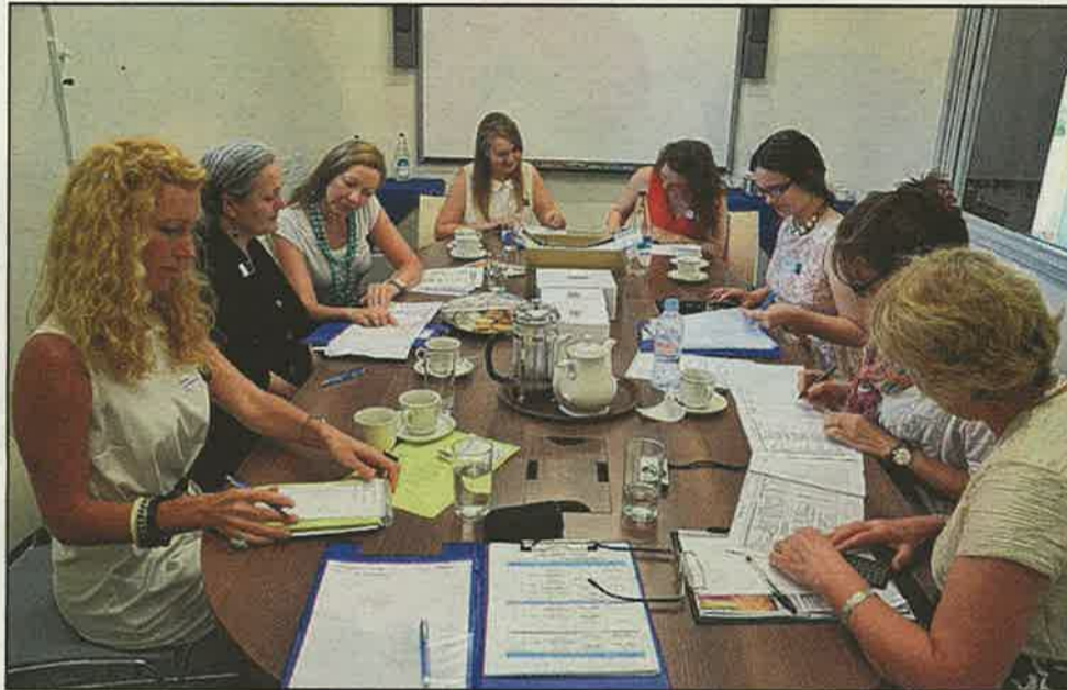
SHORTLISTING: The judging took place at Kent College