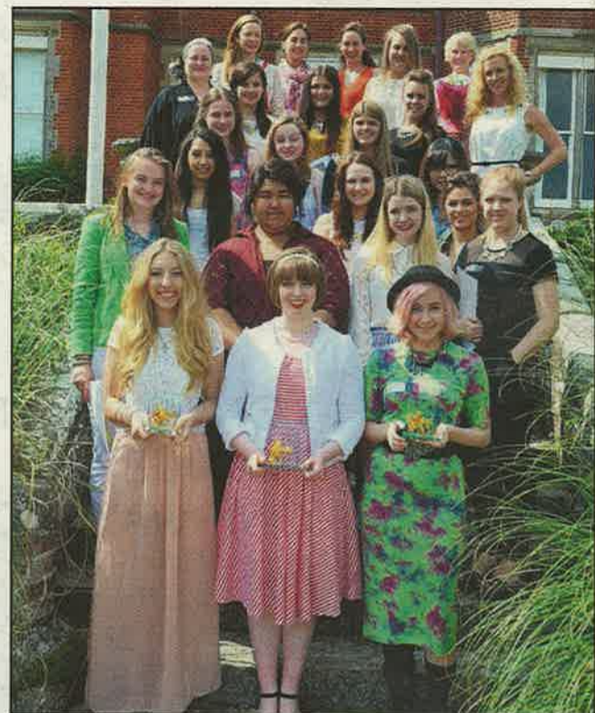
TOP DESIGNS: Winners, front, with other finalists and the judges

"The standard of entries has really increased since the competition started and it was incredibly difficult to judge them."